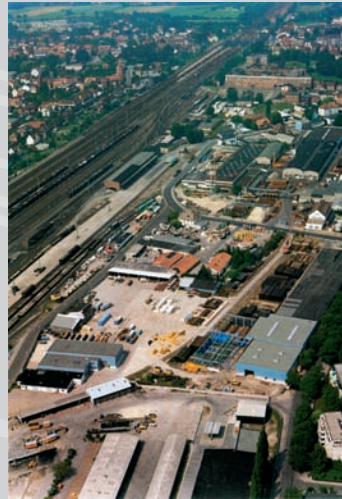
ITAG site in Celle. Celle was the „Home of Drilling in Europe“ since the first successfully drilled oil well was completed in 1858.

Test benches enable pressure testing of sizes up to 60 in. bore diameter, pressure range is available up to 4000 bar.