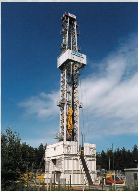
ITAG Rig 30, A New Concept for a Drilling & Workover Rig