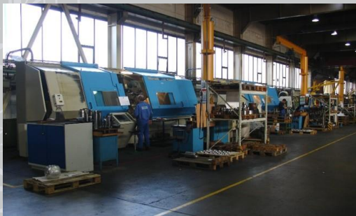
CNC lathe, weight of work pieces up to 30 tons