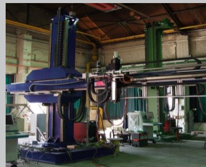
Welding installation for fully MJW