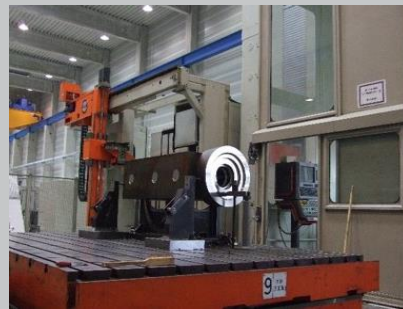
CNC machining center weight of work pieces up to 40 tons