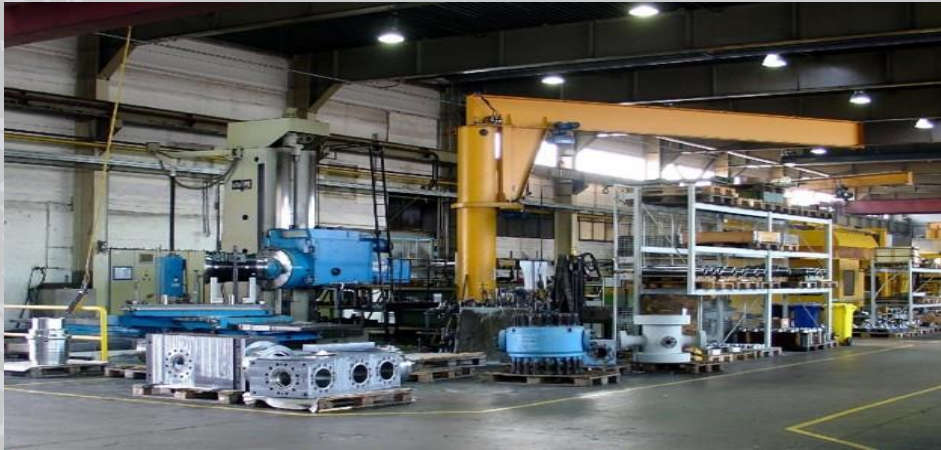
Factory workshop with CNC lathes and CNC machining centers

9 CNC lathes and 5 CNC machining centers allow precise and productive machining of valve components.